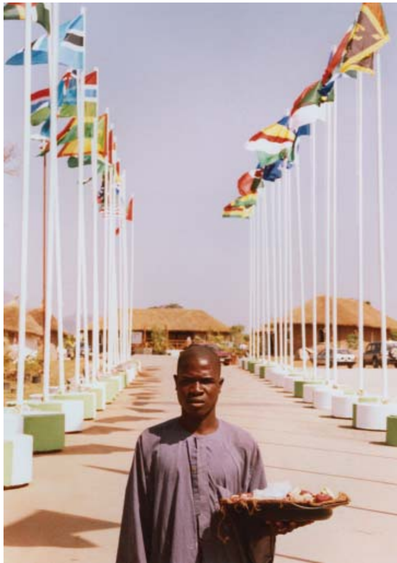
People and the Commonwealth: so near and often so far

"At present it [the Commonwealth] lags behind other international institutions such as the United Nations and the Bretton Woods institutions, which have instituted direct links with civil society organisations," says the letter. It adds that, "While Commonwealth meetings are valued as places where countries meet on more equal terms than in other international fora, at the same time civil society has less opportunity to engage than in other for a."